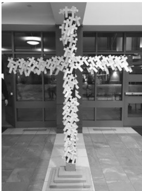
The Living Lenten Cross focused on Saint Elizabeth's six core values.